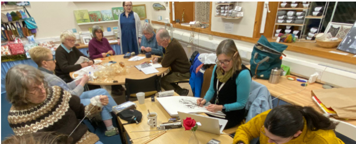
January’s Art & Craft night - a fantastic turnout!