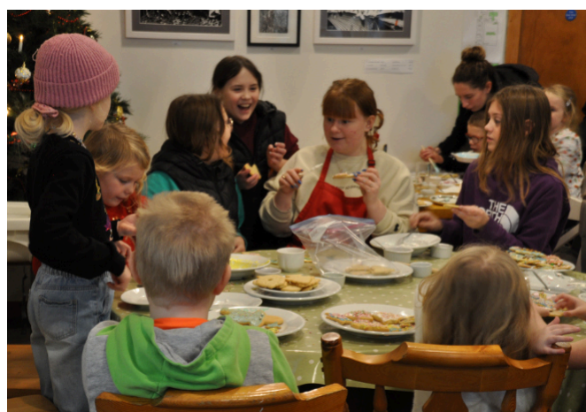
No takers for the 'less-is-more' approach!