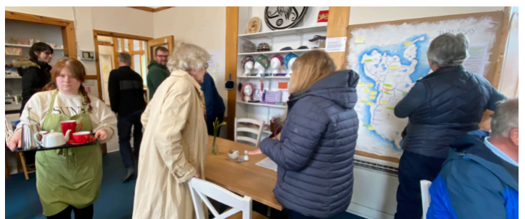
The first open day of our community consultation.

All are welcome to our AGM, 7.30pm, Tuesday 20 th February, at Speldiburn.