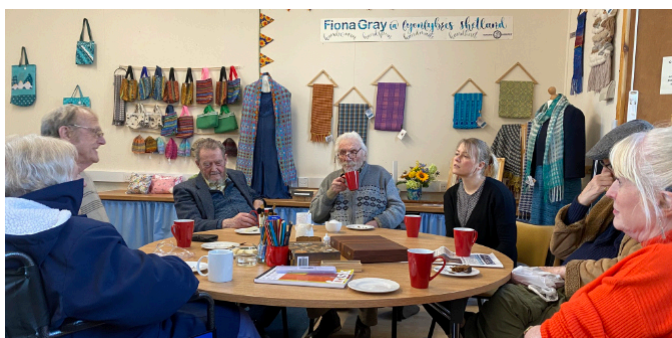
Chatting at the social afternoon.