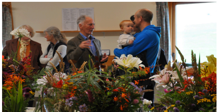
Bressay Garden Show.