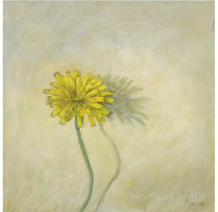
'Shetland Hawbit' 2019 20x20cm, by Heather Christie.

Heather's series of beautifully observed studies of common wildflowers are painted in acrylic on dibond aluminium panels. The exhibition titled 'Peerie Flora' can be seen on our website www.bressay.org/arts-crafts/exhibitions until the end of August.