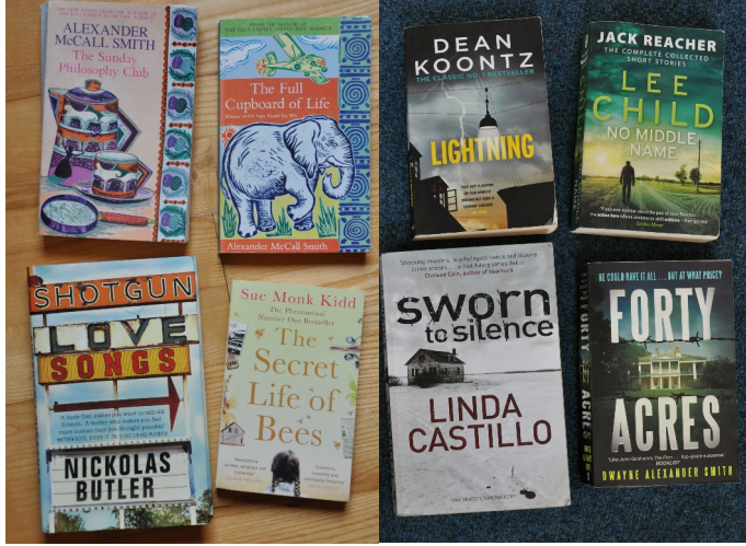
Set 'Summer Reads C'

Books and puzzles can be ordered from the online Speldiburn Library. We are happy to deliver them free of charge to anyone in Bressay or we can arrange for you to collect them. We've added a couple of examples of the sets you can choose from below but there's plenty more online.