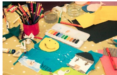
Our well attended afternoon produced much discussion and creativity