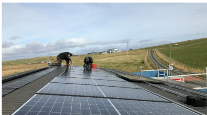
Above | Nordri fitting the solar panels; the solar panels are fitted to both the east and west roof to maximise the daylight they receive.

The contractors all did a fabulous job and we are delighted with the outcome. We would like to thank them all for their help and attention to detail - Shetland Heatwise (insulation), Heatsave Shetland Ltd (Air Source heating) and Nordri (solar).