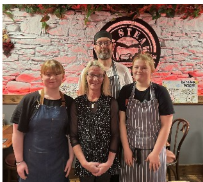
The Steakhouse Team