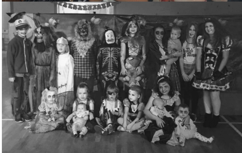
Scary party goes at the Youth Club Halloween party in the Hall.