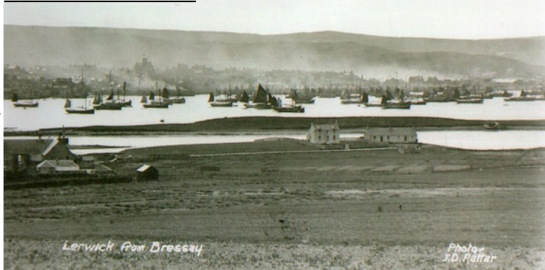
Lizmore House and Cottages, Hunchibanks. Lizmore House was built in 1903 or 1905