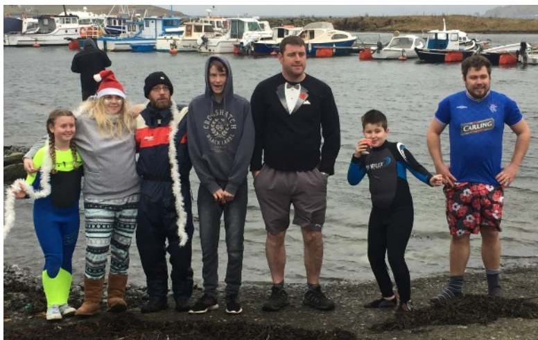
Well done to everyone who braved the the New Year's dook on the 29 th of December.