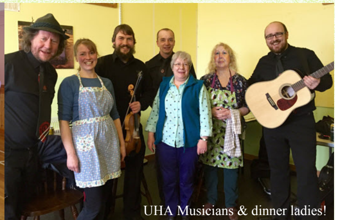
UHA Musicians & dinner ladies!