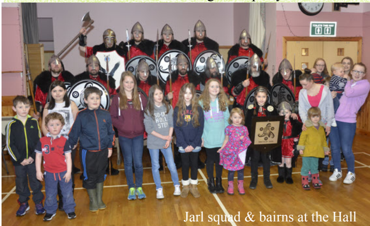
Jarl squad & bairns at the Hall

We also have a new email info@bressay.org & phone 07547 280040.