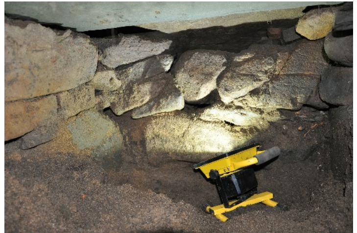
The far end of the tunnel was initially obscured by sandy soil. Though seemingly less well finished than the rest of the passage it did prove to be a dead end.