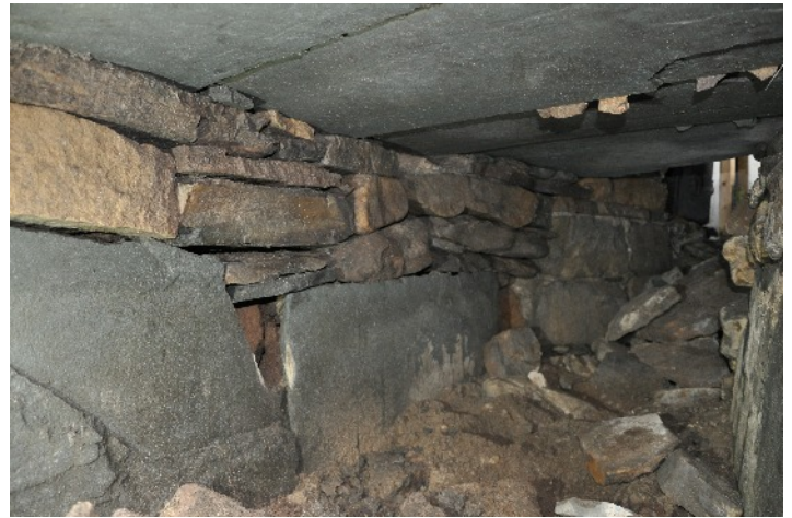
Taken from below the collapsed part of the tunnel looking towards the entrance into the visitor room, this photo shows the well built walls and roof along with some remaining debris.