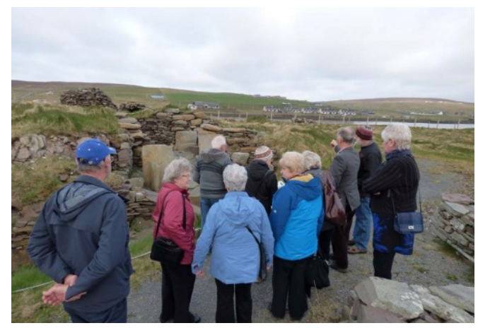
Members of Cunningsburgh History Group taking a tour of the burnt mound.