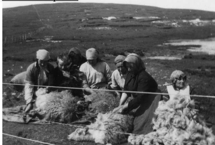
Unknown individuals rooin sheep at Beosetter in the 1920's.